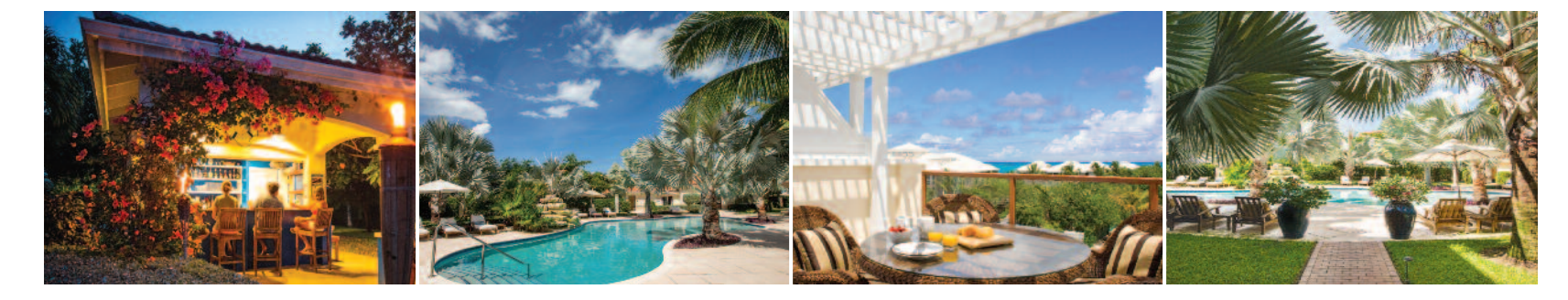
The perfect Turks and Caicos hide-away. Only 42 graciously appointed accommodations – from deluxe studios to two bedroom suites and stunning penthouses – frame a lushly landscaped courtyard. There are two inviting heated pools, a soothing hot tub and a Tiki bar. You will find extraordinary service on the world's most beautiful beach. Our private greeter will bring you whatever you need – loungers, towels, umbrellas and refreshing drinks and cocktails.