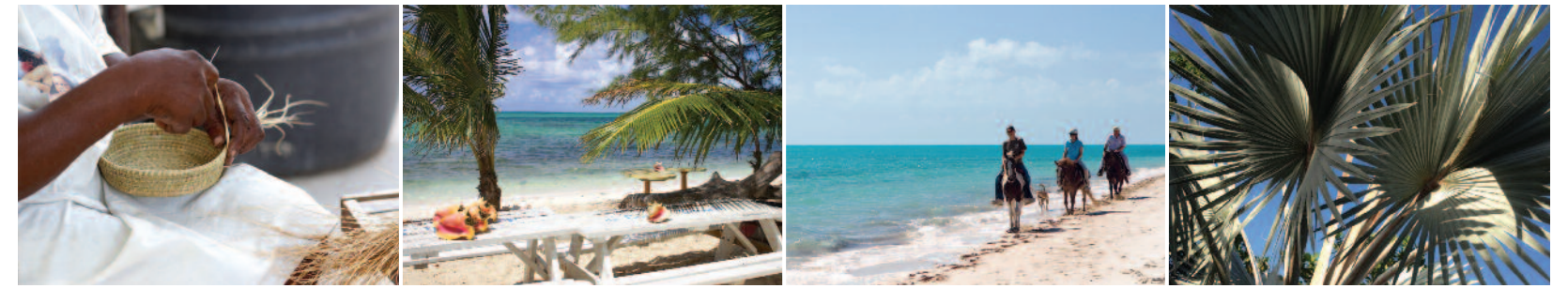
Sophisticated. Secluded. And very under the radar. The Turks and Caicos Islands are one of the world's most desirable destinations with extraordinary natural beauty, rich sea life and an idyllic climate. And no cruise ships anywhere near Provo. We told you it was private. Our friendly and thoughtful staff is ready to help organize any activities. Or not. The choice is entirely up to you. Come discover the Turks and Caicos' best kept secret. Just don't tell too many people.